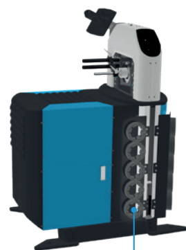
Side die rack as an option, 5 slots (Compact only)