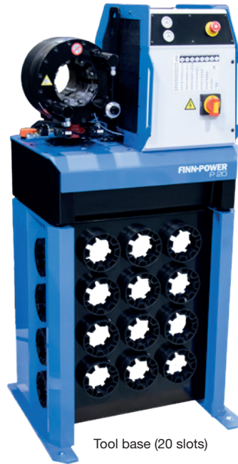
Tool base (20 slots)