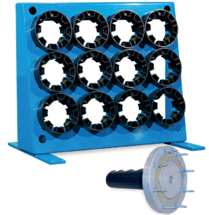
Tool base and Tool rack with QuickChange-tool as an option.